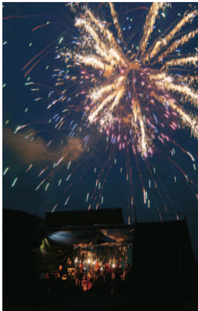
The fireworks finale over the stage

(The Executive Summary from the Southern Upland Way User Survey can be found on the Publications page of the SUP website – www.sup.org.uk – or a summary for businesses along the route can be obtained by calling 01644 420808).