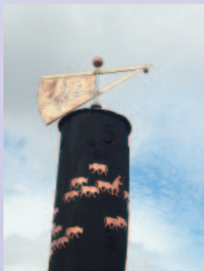
The obelisk windvein showing design commemorating the routes droving history.

The Executive Summary of research carried out into the potential for trail riding businesses can be found on the SUP website, www.sup.org.uk