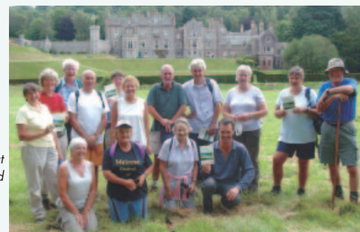
The Paths Group at Abbotsford

If you would like further information on Scottish Border Paths, please email: outdooraccess@scotborders.gov.uk or telephone 01835 826 509.